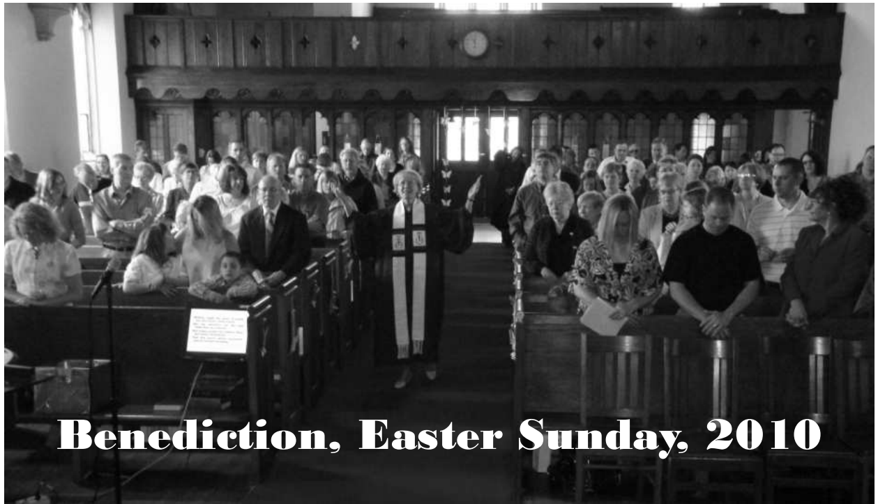
Benediction, Easter Sunday, 2010